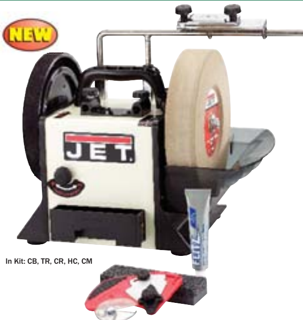
In Kit: CB, TR, CR, HC, CM